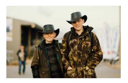
Students and Future Farmers