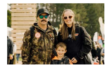
Farmers and Growers on-farm